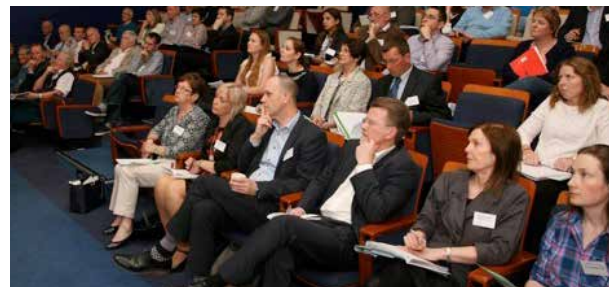
Green Business seminar held in Horse & Jockey Hotel, Co. Tipperary

Limerick Local Enterprise Office recently ran a seminar at Fitzgeralds Woodlands Hotel, Adare in association with the Southern Region Waste Management Office. The event featured many practical examples of Cost Savings for your Business through efficient use of Materials, Energy and Water – this was the theme for the event. All the speaker presentations can be accessed through the Homepage of www.southernwasteregion.ie .